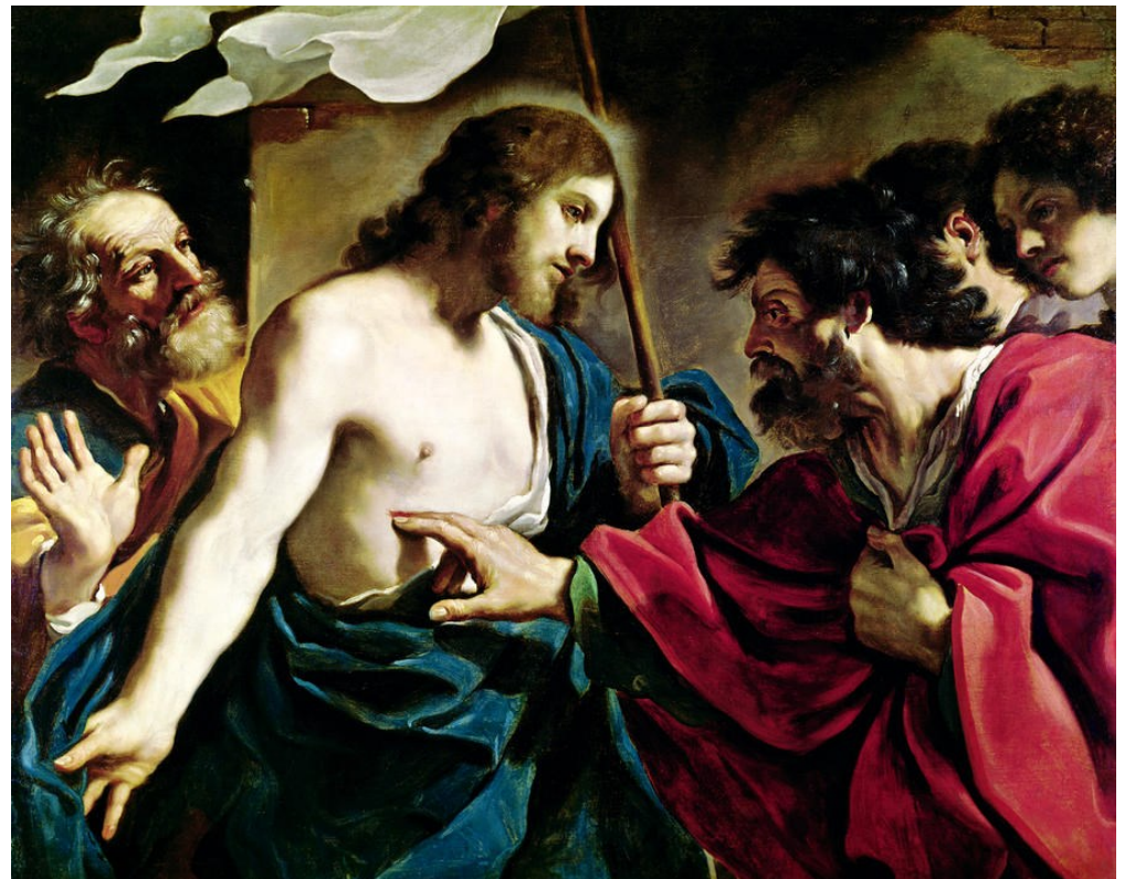
Doubting Thomas by Guercino (1591 - 1666)