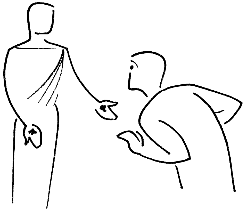
'See my hands!'